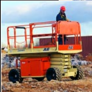
Standard Four-Wheel Drive for Terrainability