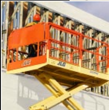
Large, High Capacity Work Platform