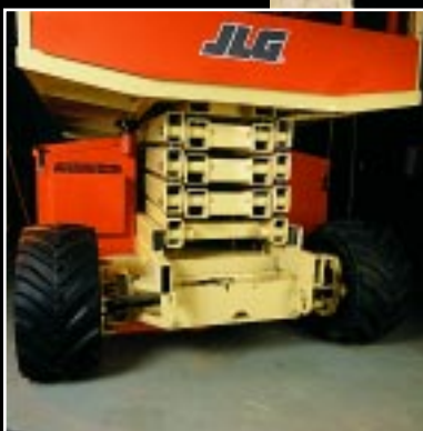
Strengthened Arm Stack for Improved Stack Rigidity